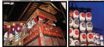
Kyoto Gion Festival with tour departing 13th July'09